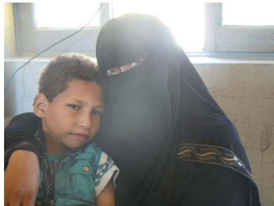
New fantastic help in the classroom