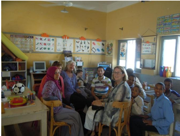
Here you enjoyed yourself!