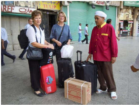
Ready for the 900 km long trip to Siwa. carried...