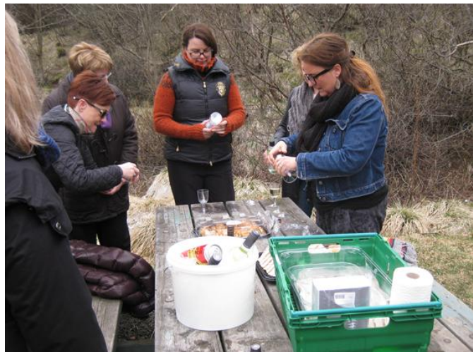
Participants from Akureyri and surroundings enjoying a picnic on the way to Ísafjörður. The temperature is about 4°C