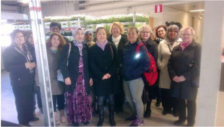
Group of Daisy Ladies visiting Vocational School Institute Livia in Kaarina town Finland. After the visit in Livia we were served in lunch by a lady from Tunisia

immigrant women in their efforts to adapt themselves to new circumstances in Finnish society. The association needs volunteer workers to run its programme because it is only partly financed by public funds. Five retired Gamma members were willing to participate in the programme. We considered it a challenging and inspiring task. It suited us well since we all had a long teaching experience and enough time to do volunteer work.