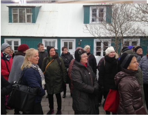
“History walk” in Ísafjörður

The very last item on the agenda was the Conference banquet at Tjöruhúsið where we had a wonderful meal and enjoyed the company of each other as well as some entertainment.