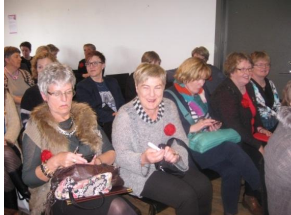
Waiting for the presentations to start.

http://www.slideshare.net/svavap/ut-sklastarfi )